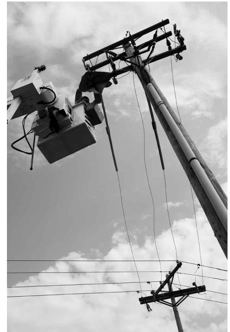
Over the last 75 years, electric co-op line workers have built enough miles of electric line to reach to the moon and back five and a half times.

But the mission’s not over. As electric co-ops celebrate October as Cooperative Month, they are focusing on keeping electricity affordable for all Americans. Electric co-ops are providing a strong voice